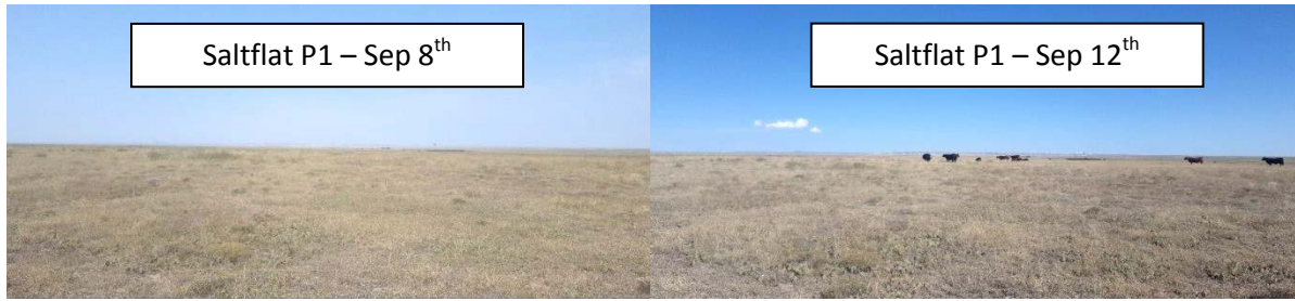
Above: Comparison between a week on the upland.