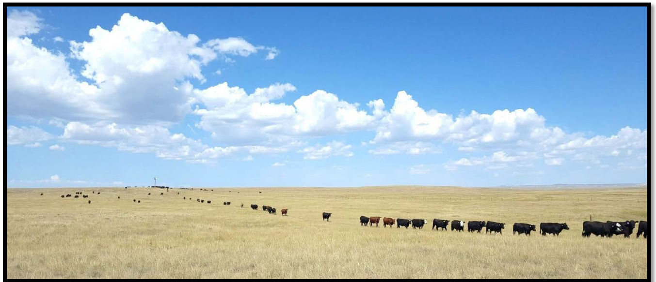
Desktop Field View: from our office to yours.