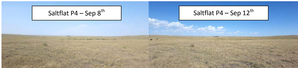
Above: Comparison between a week on the saltflat.